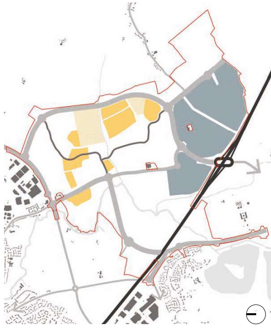
Key plan - Phase Two (indicative only)