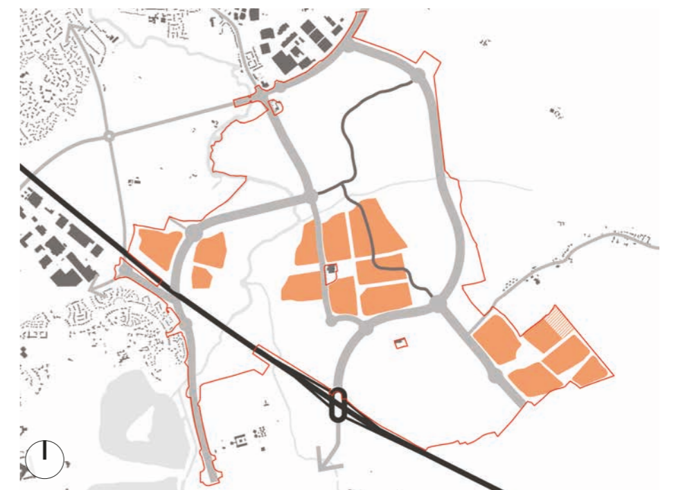
Key plan - Phase Three (indicative only)